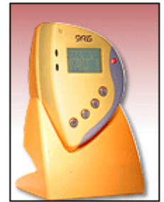
❖ T&A Series

We provide different access control systems, secure and reliable to match with different needs.